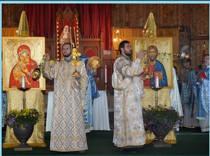
Divine Liturgy on Monday: Eparchy of Edmonton